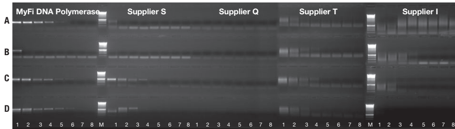
Fig. 2 Greater reliability with GC-rich DNA

An advanced buffer system and enzyme blend combine to give increased target affinity, ideal for amplification of cDNA libraries, complex genomic fragments (Fig. 1) and GC-rich targets (Fig. 2).